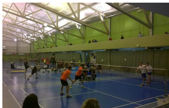
Fig. 1: Tournament hall